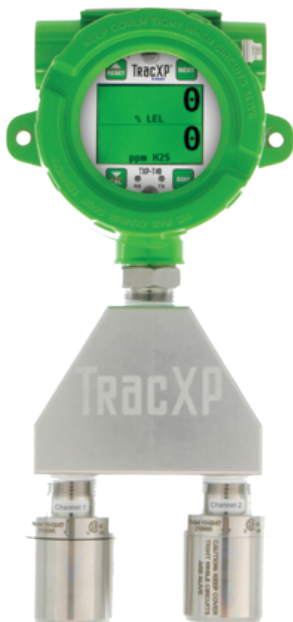
TXP-T40 Aluminum Dual Sensor

The TracXP T40 transmitter is a highly configurable fixed gas detector supporting single or dual sensor applications in Class 1 Division 1 or Class 1 Division 2 environments. Local and remote sensor options allow the T40 to adapt to a wide variety of industrial applications. TracXP intelligent sensors simplify sensor installation and configuration by transferring sensor information to the transmitter including sensor type, measurement range, calibration span values, last calibration date, serial number, and manufacture date. A vivid status indicating color display and LED notification provide superior visual verification of safe or unsafe conditions. Intuitive non-intrusive magnetic interface and embedded webpage make setting up and programming easy. Aluminum, Polycarbonate (Poly), and Stainless Steel enclosures provide alternatives to meet a wide variety of application and cost requirements.