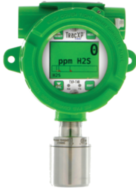
TXP-T40 Aluminum Housing