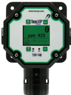
TXP-T40 Poly Housing