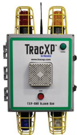
TXP-ANA Wireless with Hush