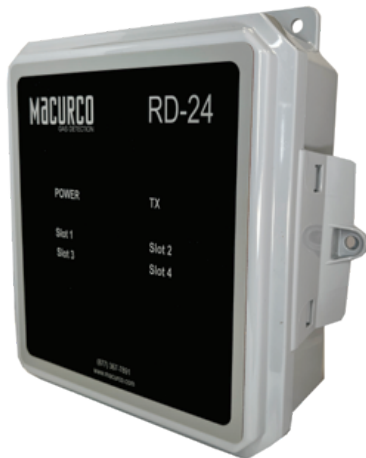
RD-24 Side View