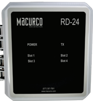
RD-24 Front View