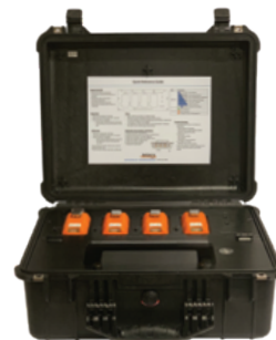
Bump/Cal Test Station (Compatible with CO, H 2 S & O 2 )