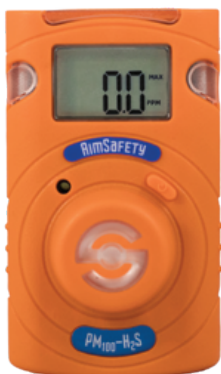
PM100-H 2 S