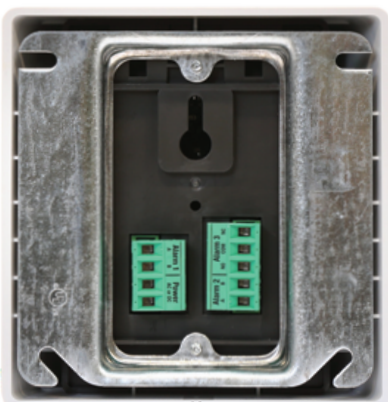
CD-6B Rear View