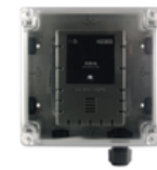
Weatherproof Housing Kit (Detector sold separately)