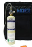
Calibration Kit (Gas sold separately)