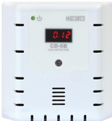
CD-6B Front View

The CD-6B is a low voltage (12-24 VAC/VDC) monitor that provides three alarm levels using three separate relays for controlling external devices. This helps to maintain acceptable levels of Carbon Dioxide in the beverage and food industries, greenhouses, pharmaceutical, and other chemical processing or other commercial applications. The CD-6B can be used as a stand-alone unit or connected to a burglar/fire panel. The monitor has a high range of 0-5% by vol. (0-50,000PPM) with a recommended coverage area of 900 - 5000 sq. ft.